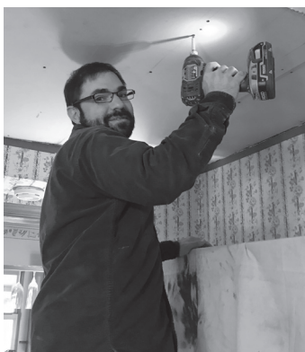
Good Works volunteer replacing water-damaged drywall