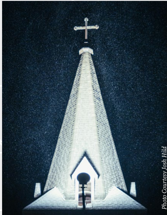
Bringing light to people living in the shadow of our steeple.

Our home repair mission attracts volunteers with a broad range of skills—from professional contractors to DIY enthusiasts, or simply people eager to